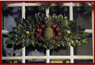
A Traditional Williamsburg Holiday Wreath